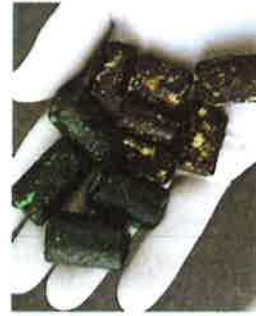
Baits covered in deer repellent. The non-toxic pre-feed pellets are brownish-tan while the toxic baits are green.

Research has allowed for dramatic improvements to the way we use 1080. Around two weeks before 1080 is aerially dropped, non-toxic bait is now dropped over the site. Possums are creatures of routine and this 'pre-feed' helps overcome their bait shyness. This increases the operation's effectiveness, so less toxic baits are needed.